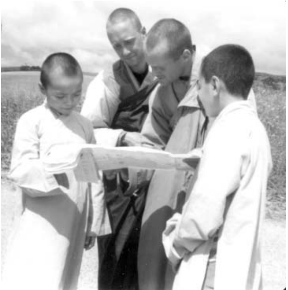
Youth from Gold Wheel Monastery hold the map while the monks check their route during a visit where the boys joined the three steps one bow pilgrimage for a few hours.