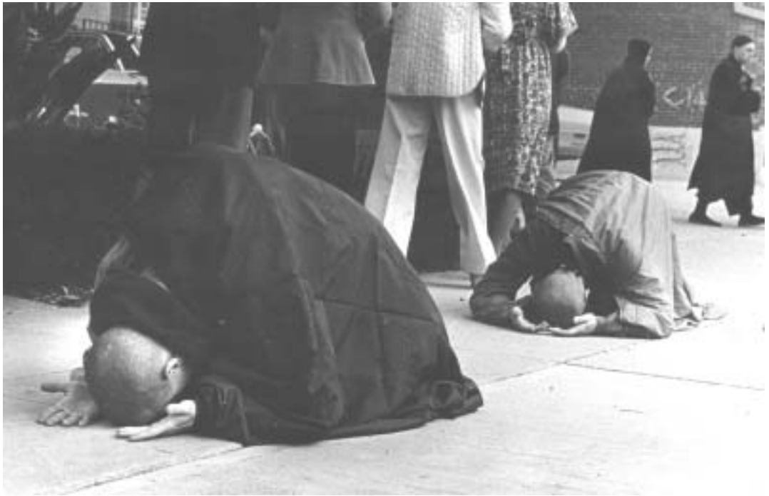
Gold Wheel community send-off. Circumambulating the bowing monks while reciting the Great Compassion Mantra.