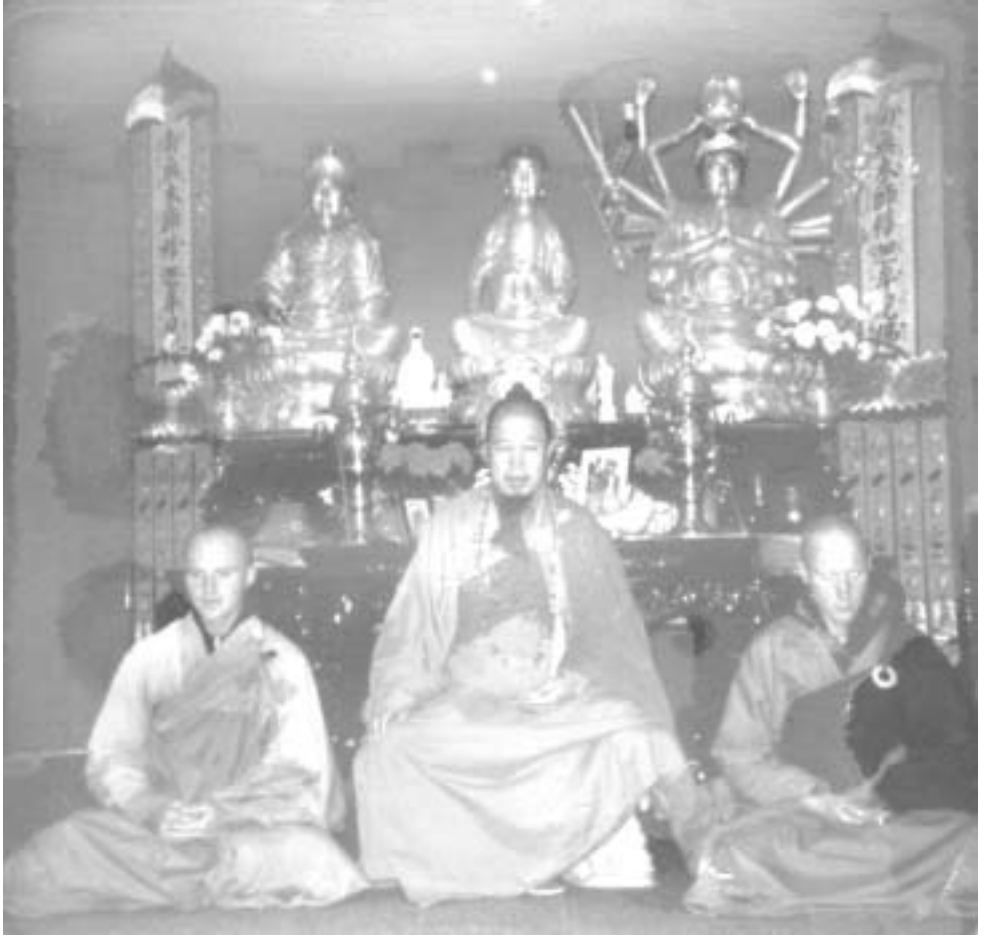
In the Buddha Hall at Gold Wheel Monastery after receiving instructions from the Venerable Abbot. November 1977