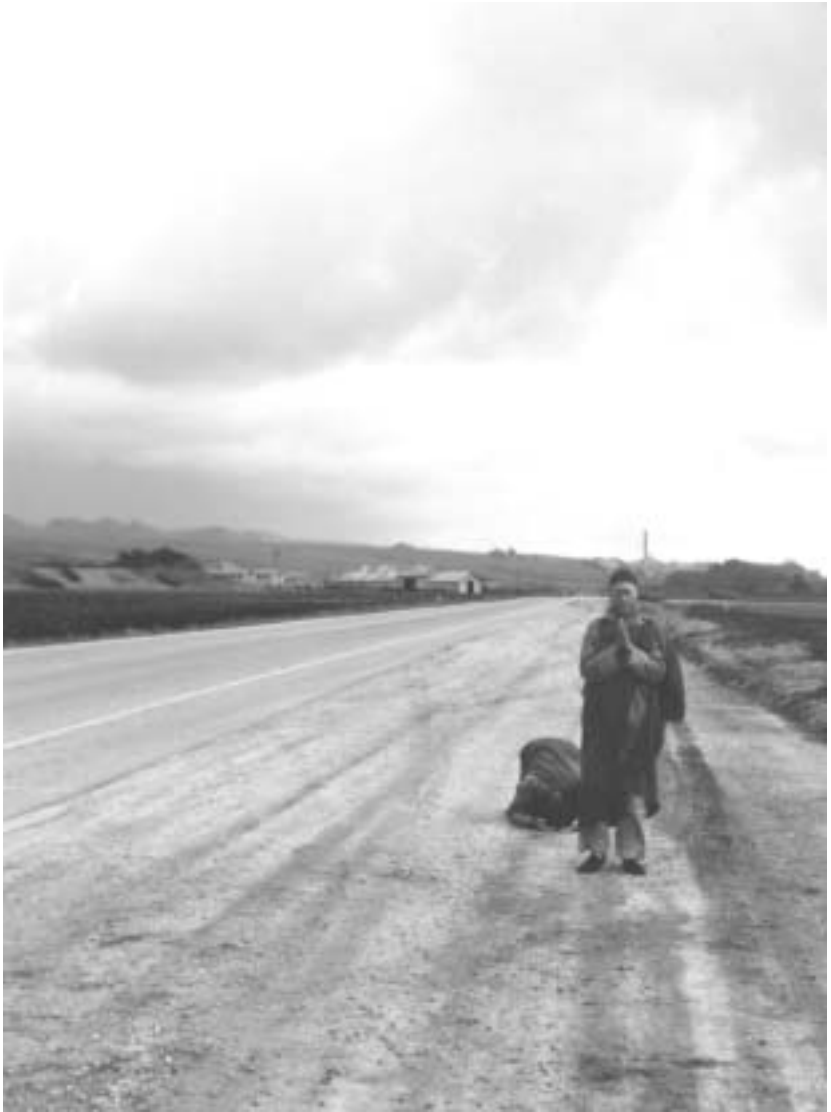
Bowing between winter storms near Morro Bay. February, 1978.