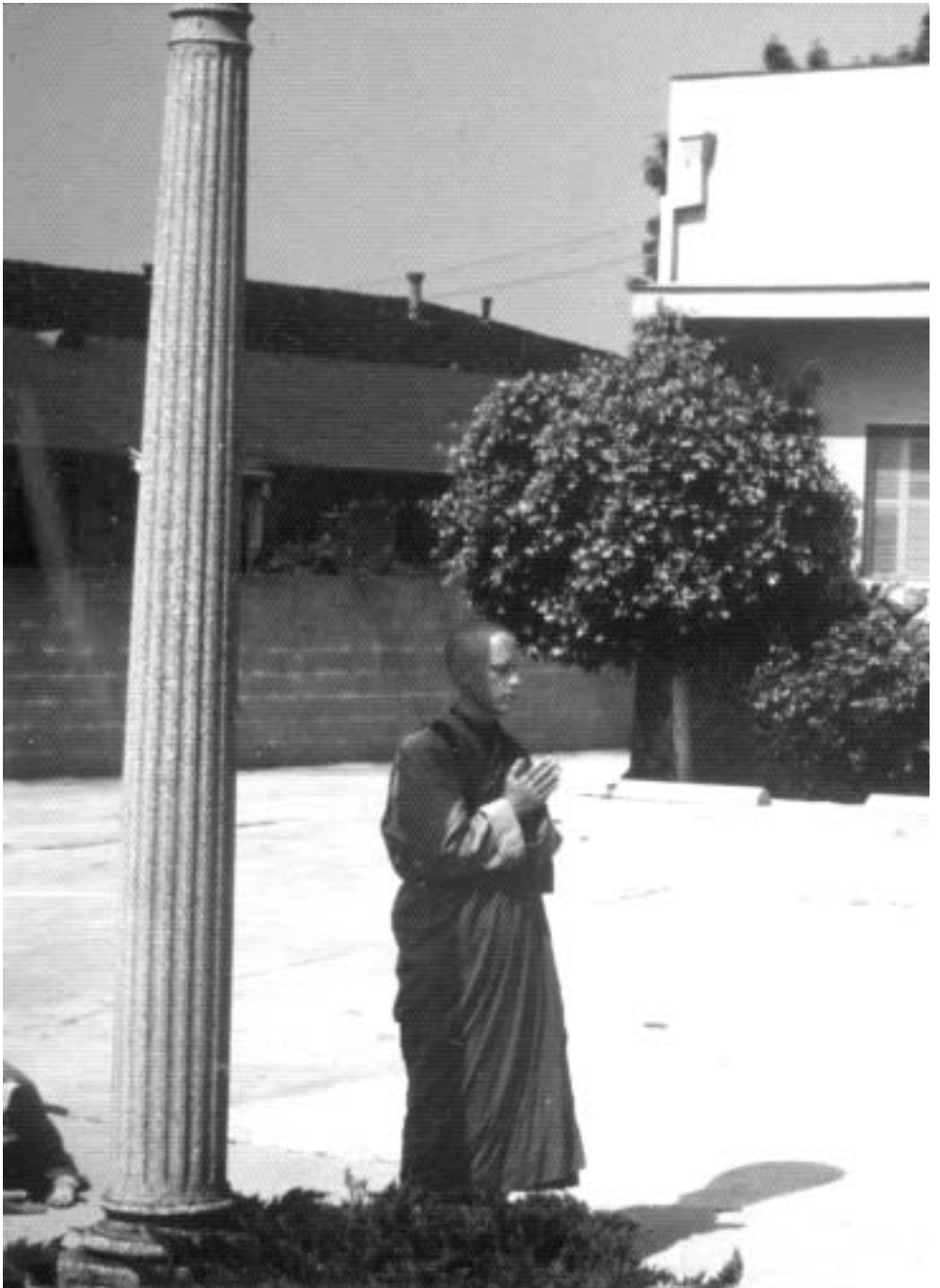
Returning to Los Angeles for instruction. Bowing in front of