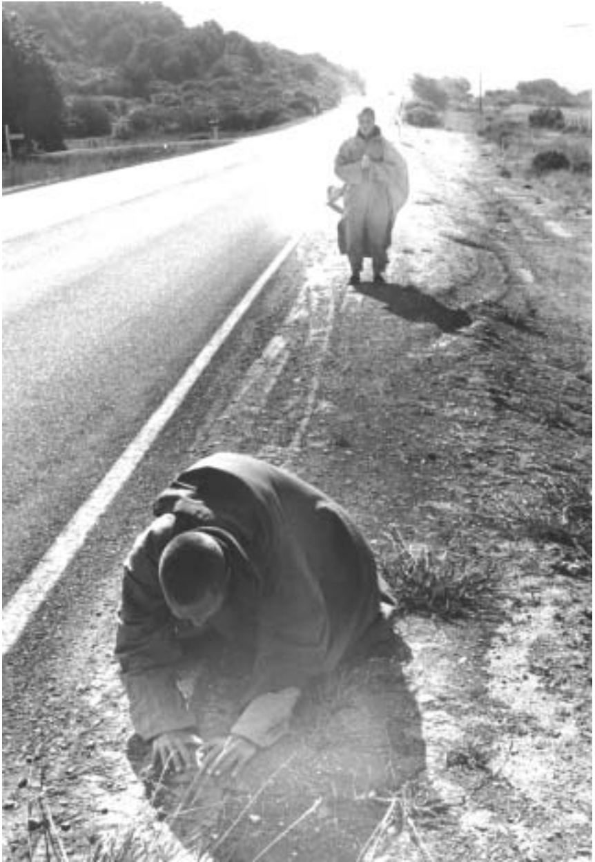
On the Nipomo Mesa. December, 1978