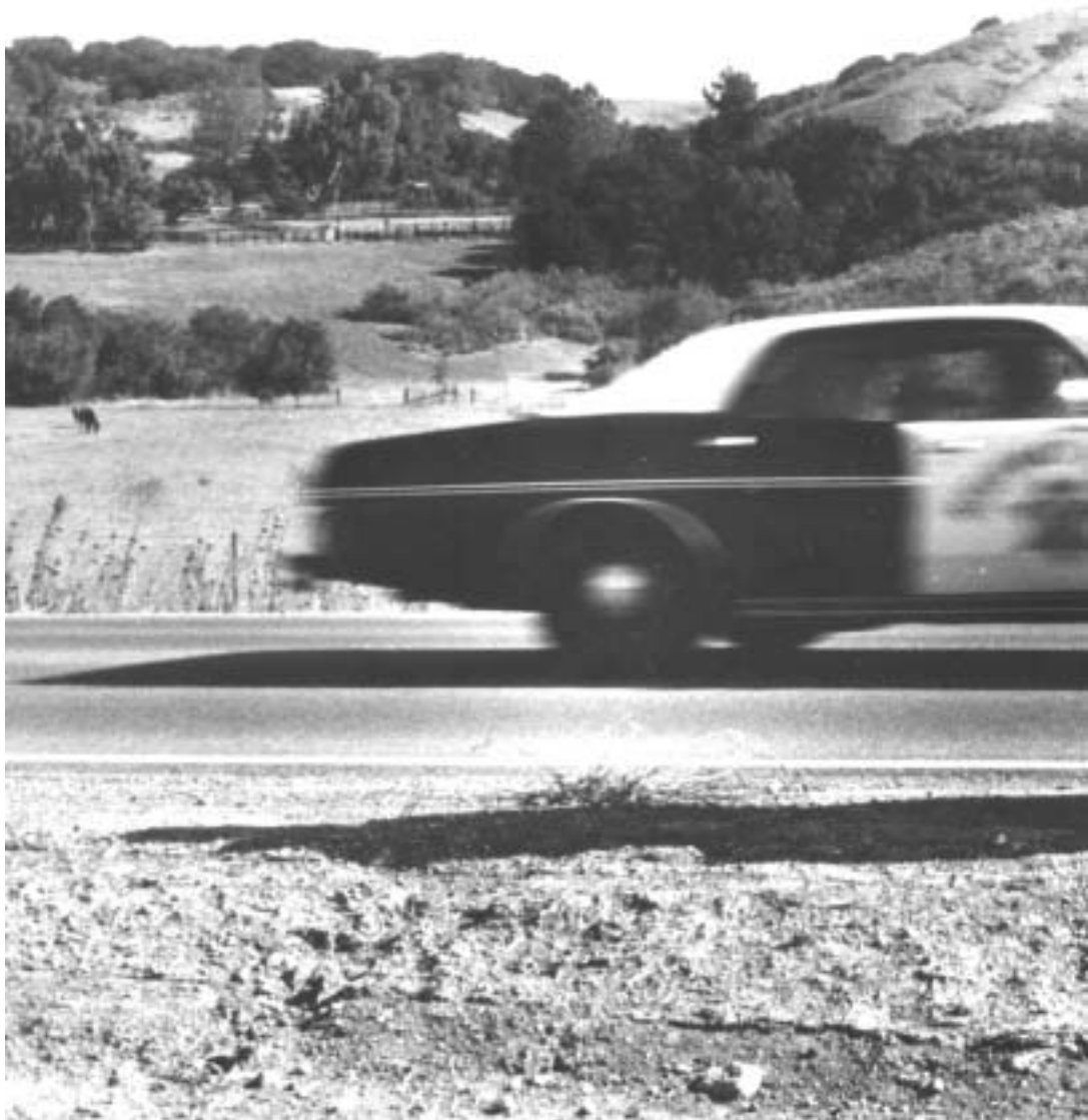
California Highway Patrol looking out