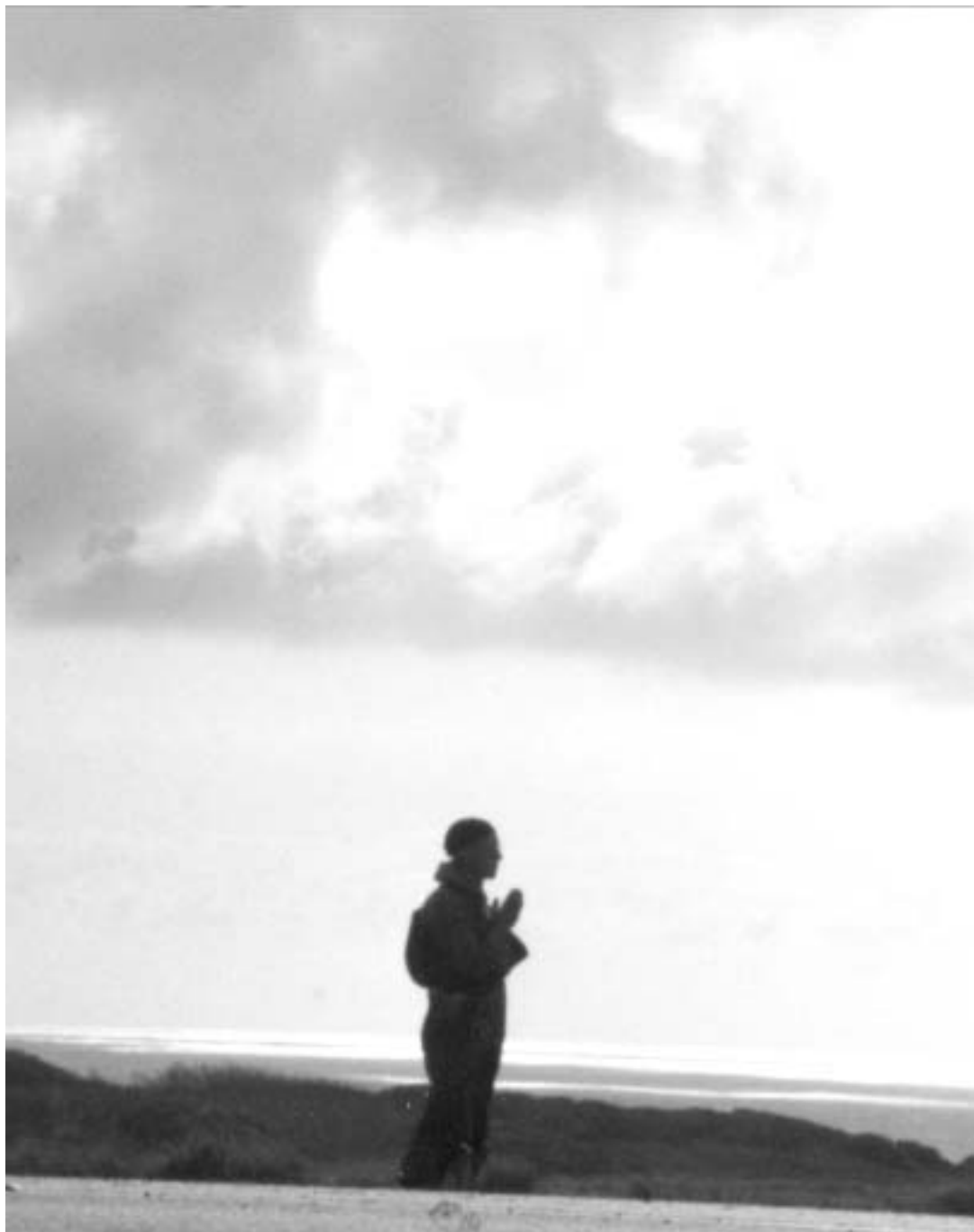
near San Gregorio, Pescadero coast. 1978.