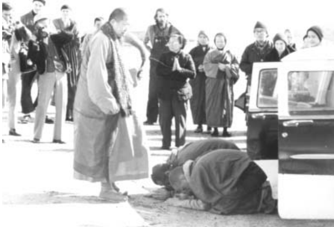
Venerable Master Hua and cultivators from Gold Mountain Monastery visit the bowing monks. Nipomo, Central California.1978.