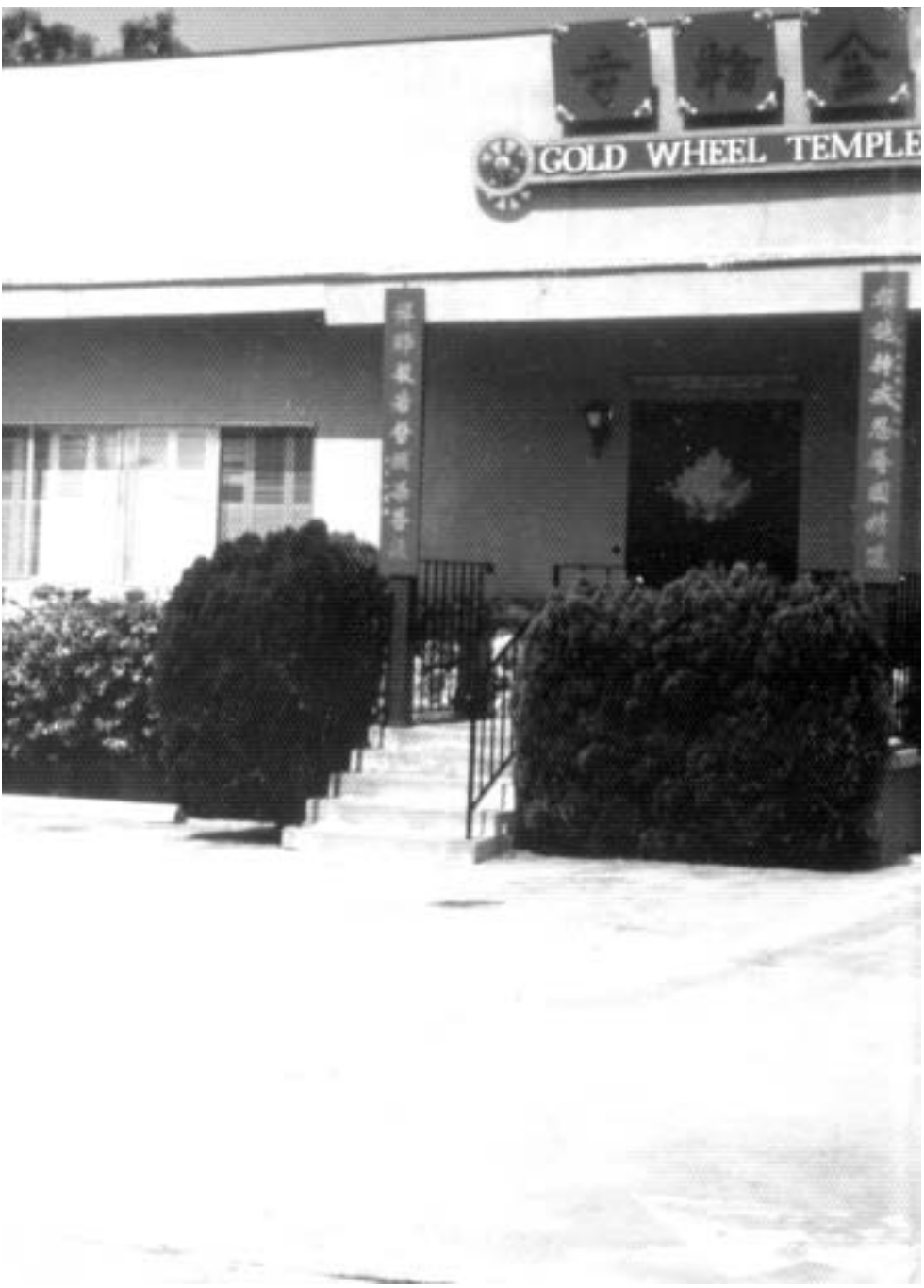
Gold Wheel Monastery, South Pasadena. November 1977