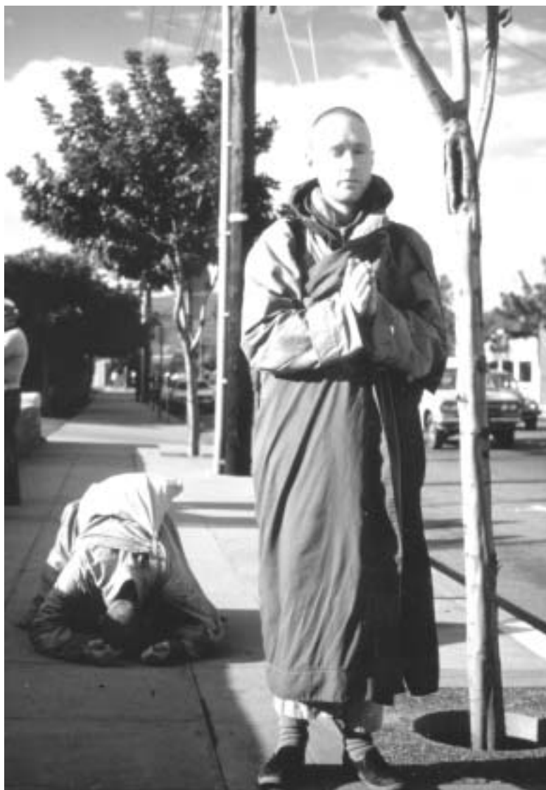
San Luis Obispo January, 1978