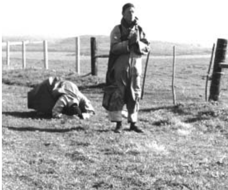
Bowing on high cliffs overlooking Big Sur coastline.