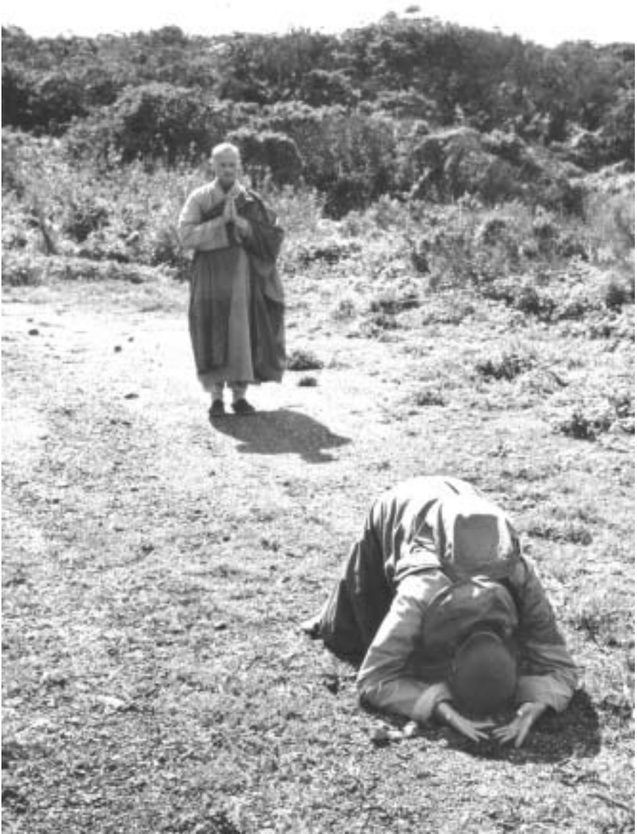
Bowing in place in a Big Sur roadside turnout.