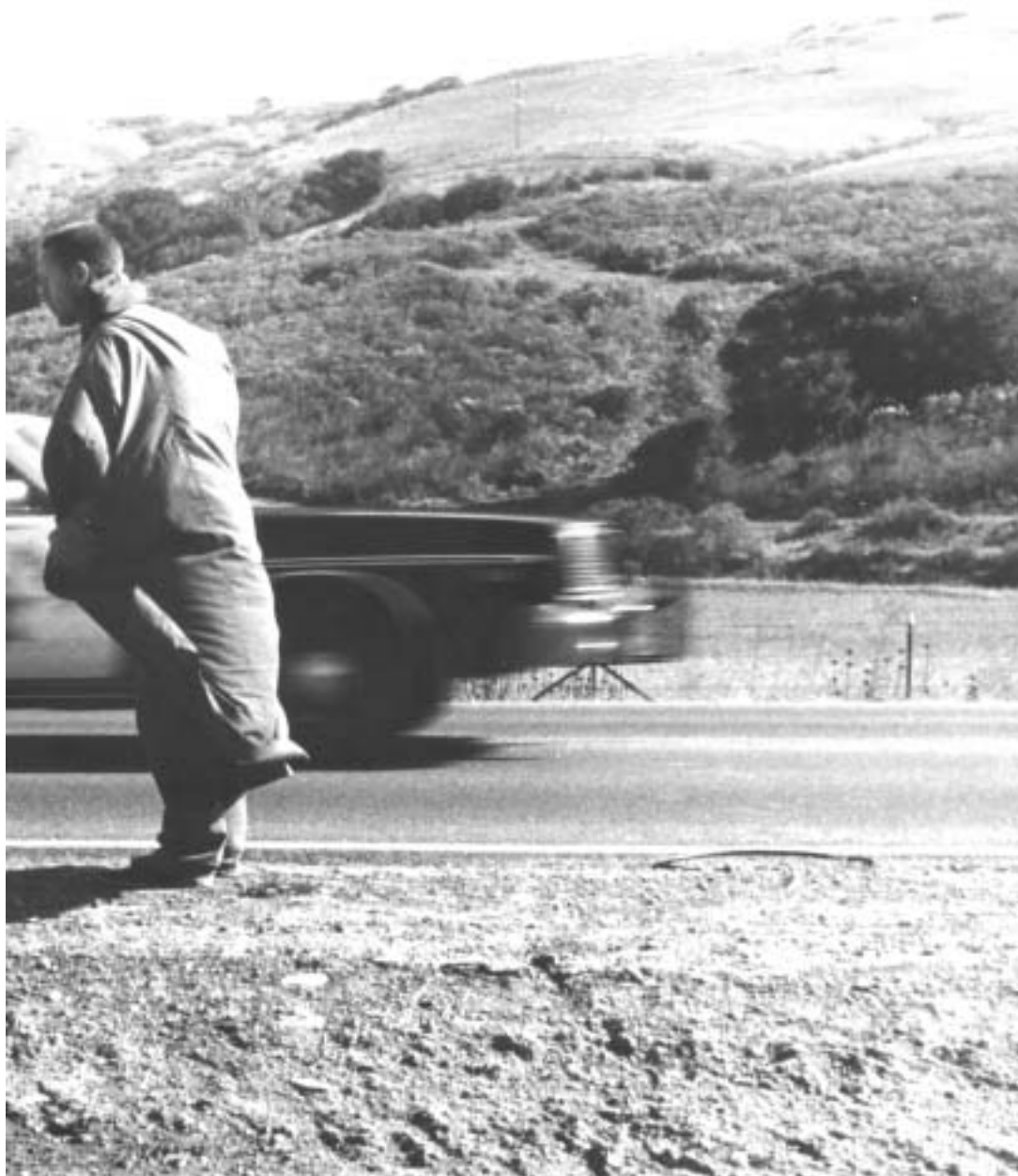
for the monks' safety. June, 1978.