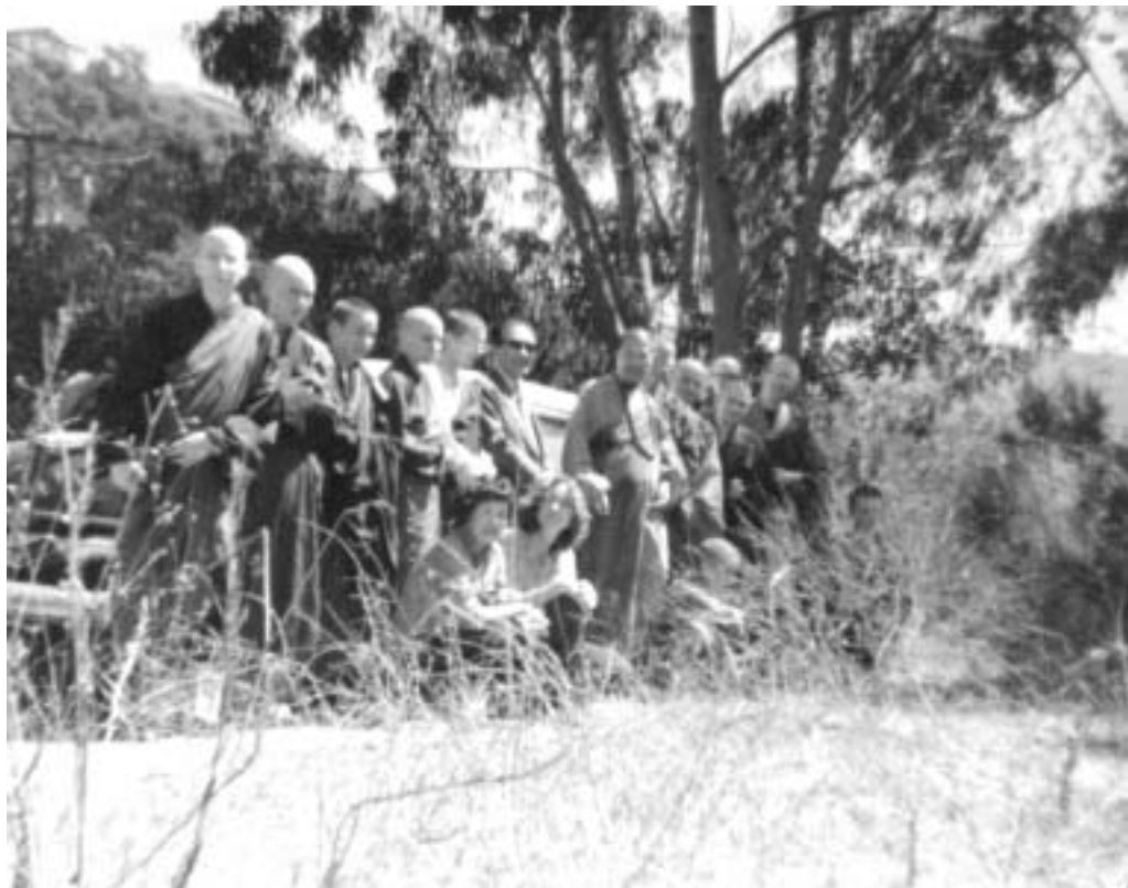
Venerable Master and disciples travel from the City of Ten Thousand Buddhas to visit the monks at the bowing site.