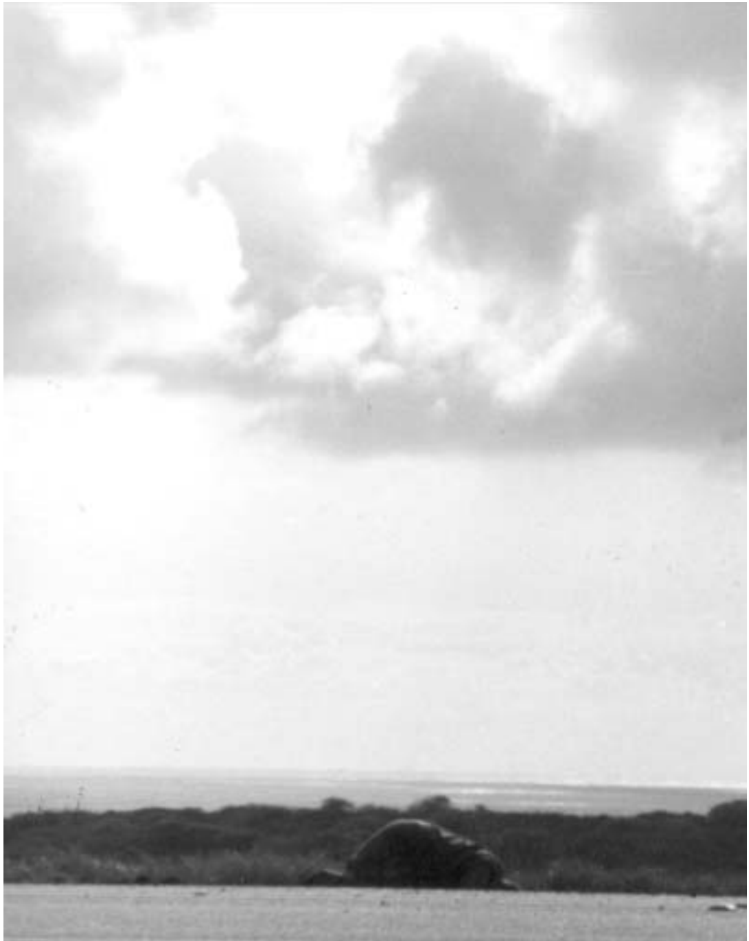
Final bows at sunset, along the Pacific Ocean