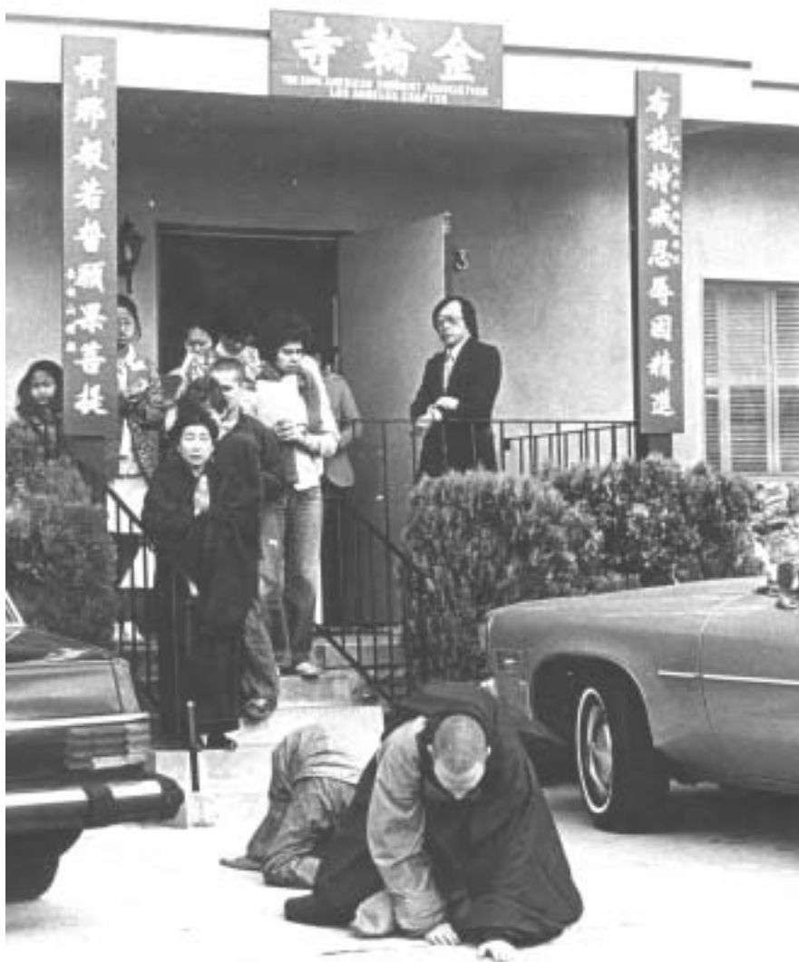
First bows to begin the pilgrimage at Gold Wheel Monastery, South Pasadena.