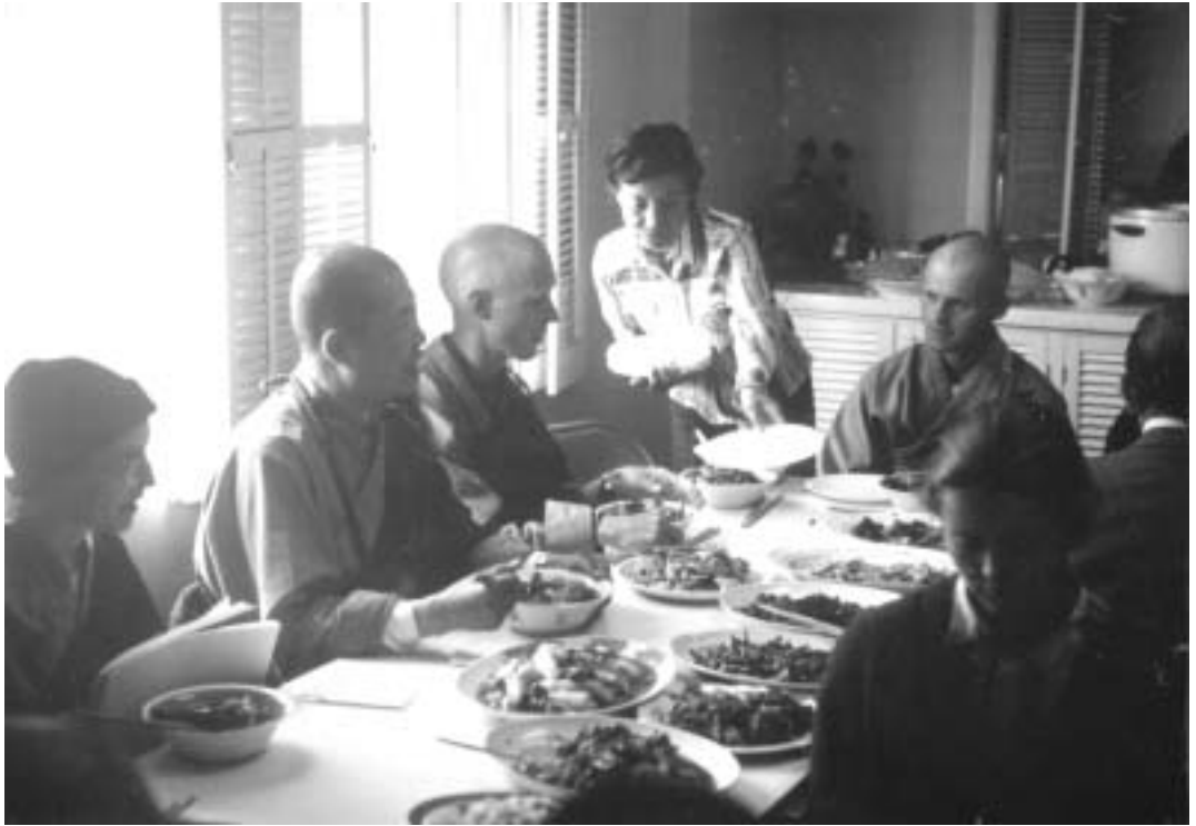
Lunch with the Venerable Abbot at Gold Wheel Monastery. April, 1978