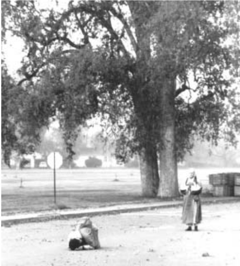
Arrival at the City of Ten Thousand Buddhas on a foggy morning. November, 1979