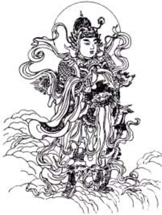
Dharma Protector Wei T'o Bodhisattva